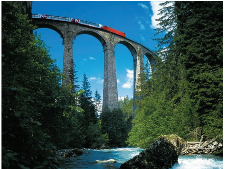
Landwasser Viaduct, Bernina Express

The dry, clear climate of the Upper Engadine Valley makes St Moritz the perfect winter sports resort, but also well-suited to long rambles, walks, and hikes across the undulating mountainside. Perhaps spend an hour or two wandering around the lake shore, admiring the mountains and the waterside, and uncovering shady groves, trickling waterfalls, and hidden caves. It is also possible to navigate higher up the mountains by rail, reaching the vantage points on the Piz Corvatsch and Chantarella at the top of the steep track. At Corviglia, a cable car takes you up to the Suvretta Mountain's most popular viewing point. Those looking for more thrilling and active experiences could partake in the water sports at Lake St Moritz or Lake Sils, or across at the high-altitude Lake Silvaplana, known for being windy.